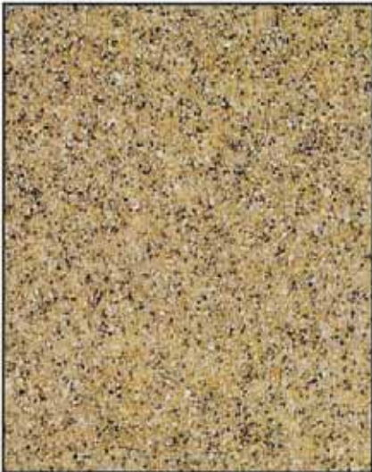
SALT & PEPPER