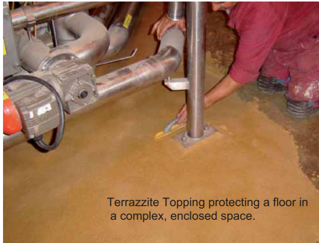
Terrazzite Topping protecting a floor in a complex, enclosed space.