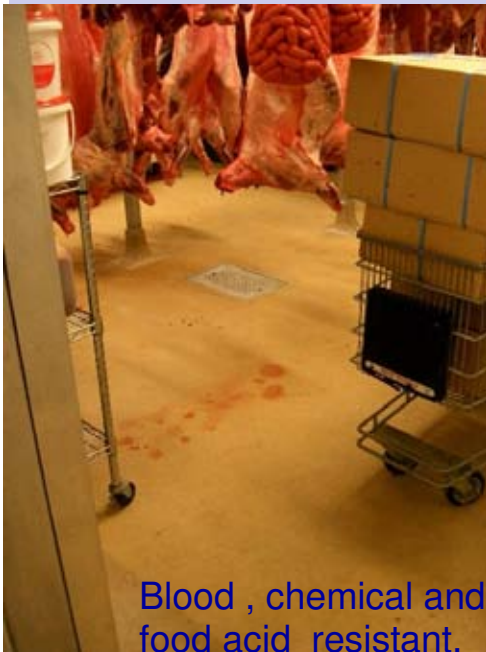
Blood , chemical and food acid resistant.

Choose Sureshield resin flooring for un-interrupted long life.